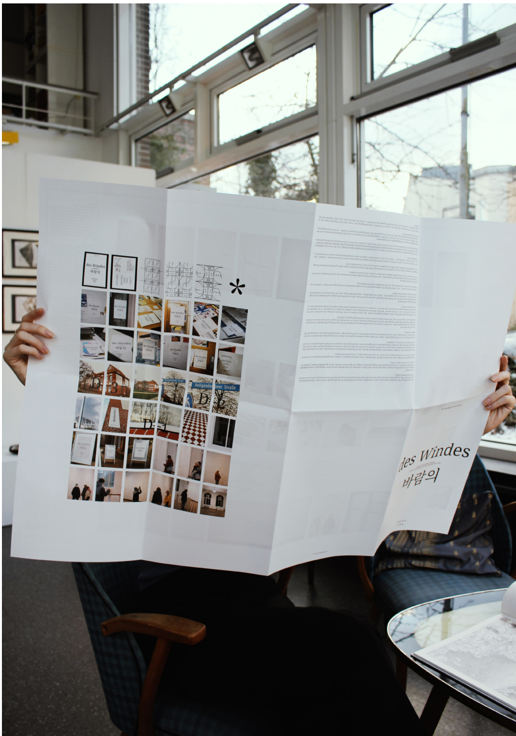
Brunswiker Pavillon, Kiel, Germany